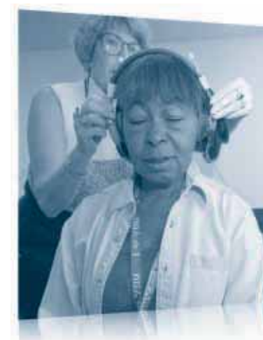
A consumer has a hearing test at the Oakland Service Center.