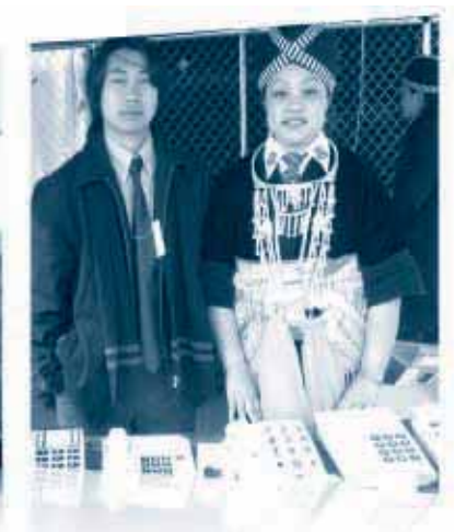
DDTP field operations staff are pictured at a Hmong New Year event.