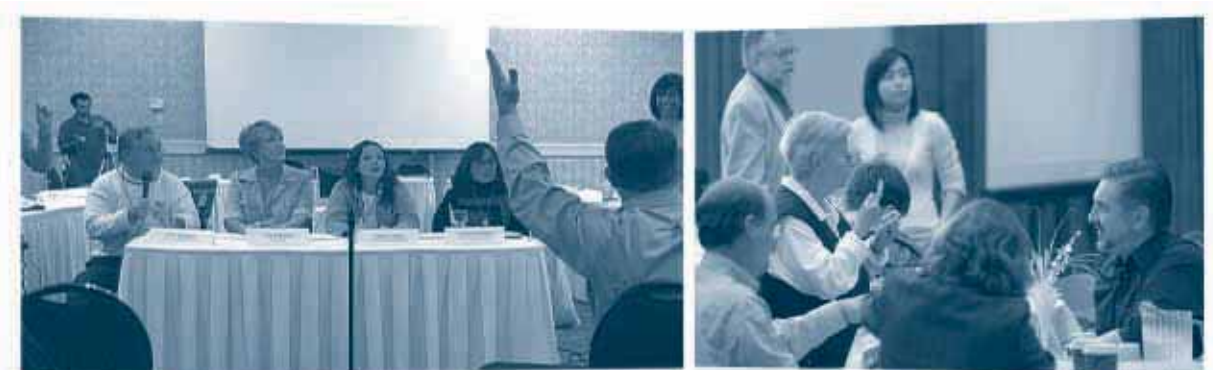
Panelists discuss the CapTel™ telephone at a CRSAC meeting.

A financial audit of the Deaf Equipment Acquisition Fund Trust was completed prior to the July 1, 2003 transition. The audit covered 10 months out of the 12 month fiscal period beginning July 1, 2002 and ending April 30, 2003.